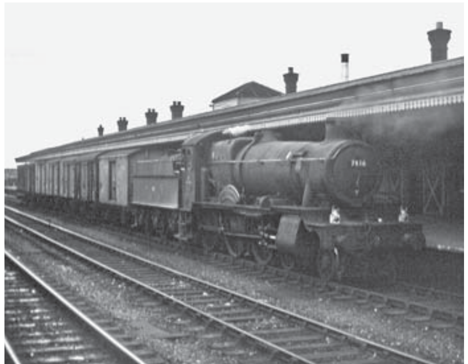
4-6-0 7816 is the pilot at Reading in 1963. It has a few pretty dirty parcels vans similar the one that was used on the Worcester to London train.