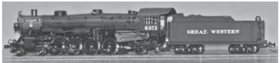
Brian Earl showed several GWR engines, including 4-8-2 no. 6073.