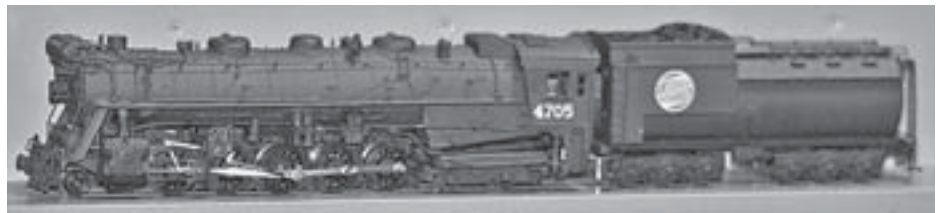
CNoR 2-10-4 no. 4705 was displayed by Tom Hood.