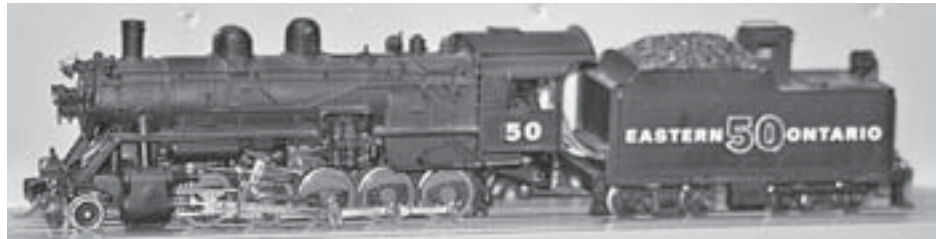
EOR 2-10-0 no. 50 originally worked for Bob Craig's Eastern Ontario Railway.