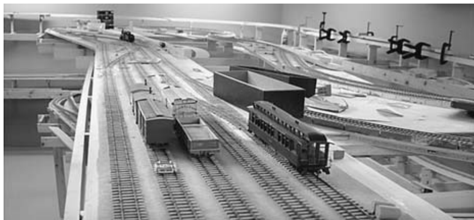
South end of Como yard with my entire roster displayed.