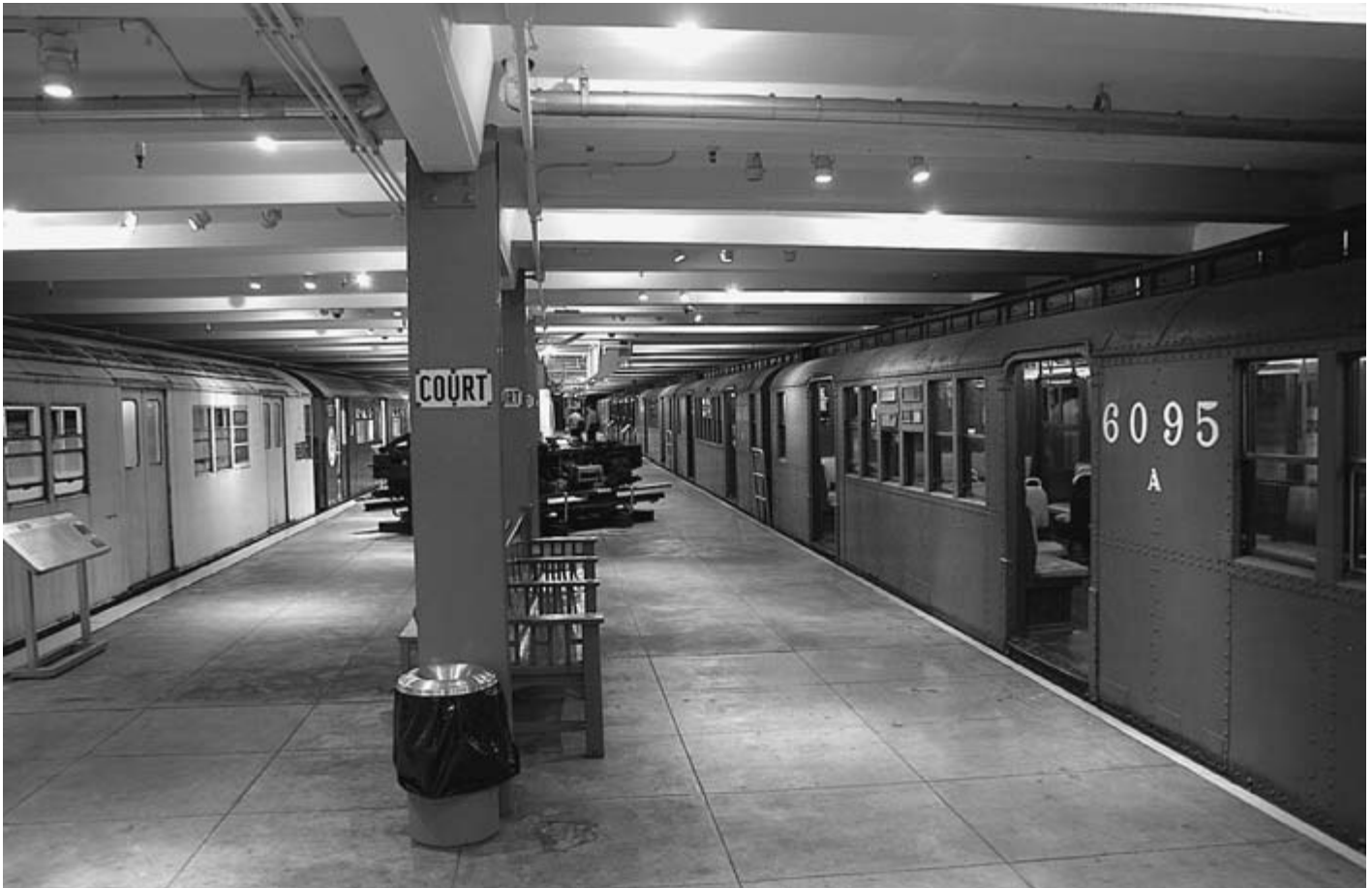
Among numerous subway cars at the transit museum, is the three-unit Triplex car at right, built by Pressed Steel in the 1920s.