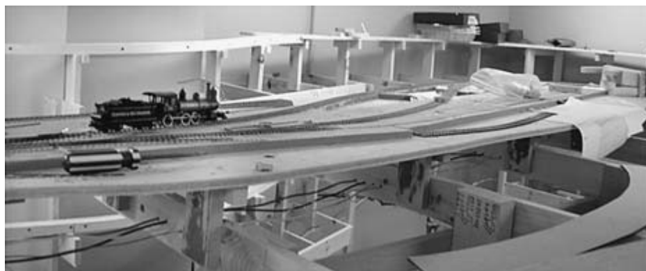
Como north yard area with Hancock in the deep background.