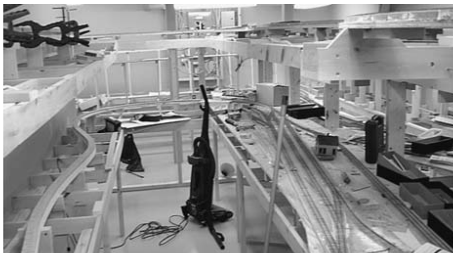
Jefferson upper right at rear with main to Hancock upper left. Gunnison lower left, approach to Chalk Creek Canyon lower left.