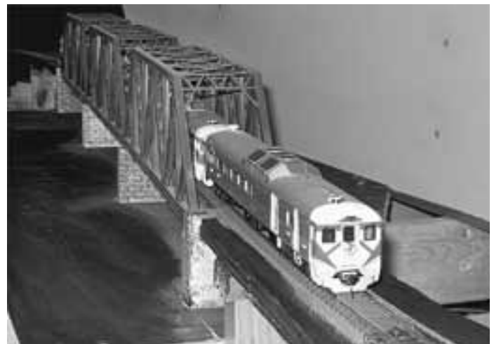
An RDC excursion train cross the Connecticut River on its way back to Portland.