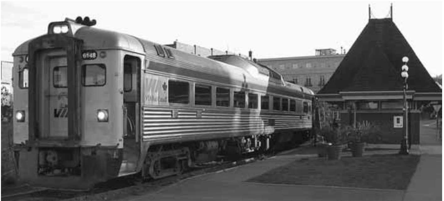
VIA train 199, a single Budd RDC, awaits its departure from the Victoria station.