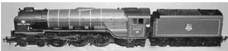
British Rail A1 in brilliant blue was displayed by Grant Miles.