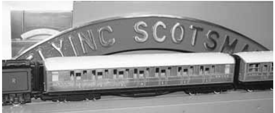
Jean-François Milotte showed souvenirs of FLYING SCOTSMAN visit to Canada.