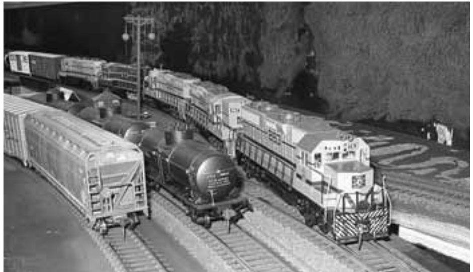
A Maine Central freight from Portland crosses the diamond at Whitefield enroute to St Johnsbury, Vermont.

Clearly, the layout is very operational. All track has been laid and painted, and the layout is DCC-controlled with Digitrax. With a bit of extra space near the staging area, Marty even has plans of extending a branch line in that area. Although the layout is not scenicked, this is likely his next big step. The layout does not seem congested with features, as he has allowed room for rolling farm land, several river crossings, and bridges. He also has plans to build a classic New England octagonal barn. I wonder