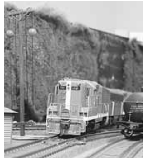
A Boston & Maine freight rolls by the ball signal as it crosses the diamond at Whitefield, New Hampshire.

If you ever have an opportunity to visit Vancouver Island, I strongly suggest that you include a train ride on the E&N to visit Marty. Well worth it!