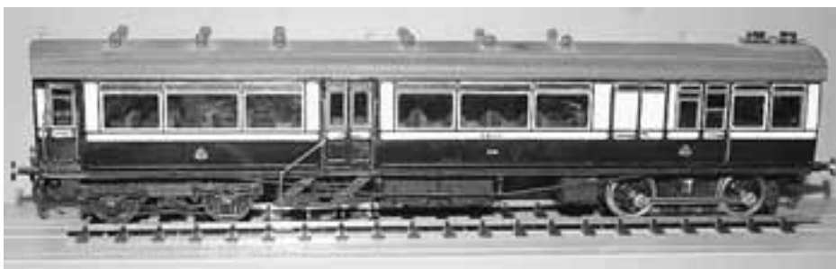
Dave Venables showed steam-powered railmotor, constructed from etched brass.