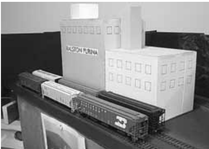
Just one of the many examples of cardboard mock-ups on Marty's layout.