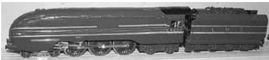
Proposed Super Coronation A4 model was shown by Jim Jarrett.