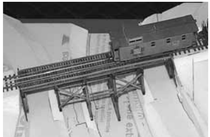
Wood trestle diorama was constructed by Grant Knowles .