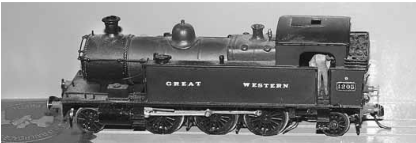
Impressive scratchbuilt model of Great Western Railway 2-6-2T displayed by Bill Lovatt took the CHAIRMAN'S CHOICE.